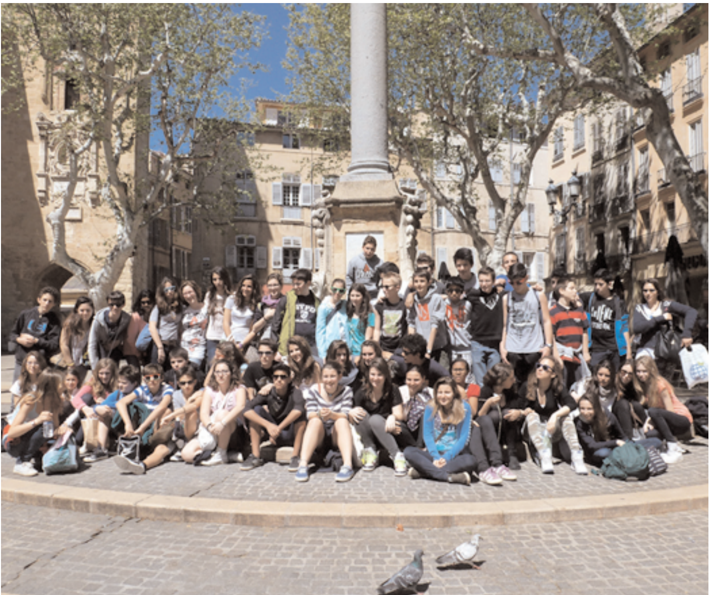
3C and 3I classes in Aix-en-Provence.